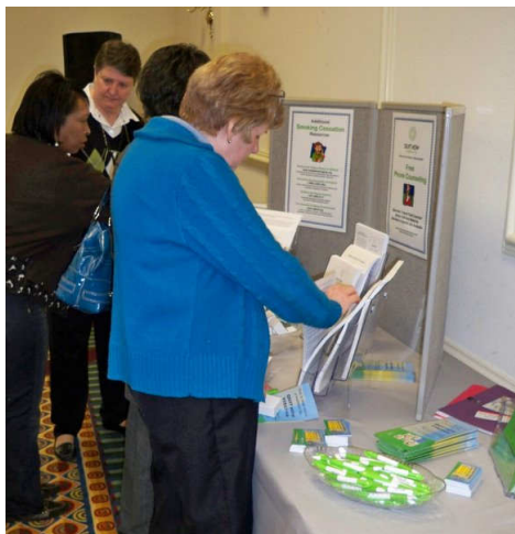
Alliance for the Prevention and Treatment of Nicotine Addiction