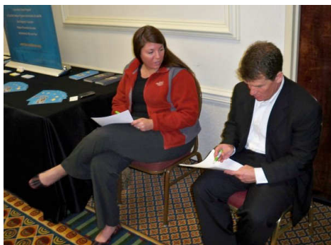
Barry Robinson Center