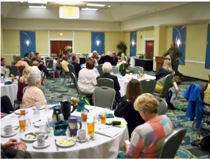
VAADAC Member enjoyed a delicious lunch!