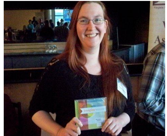
Another happy winner!