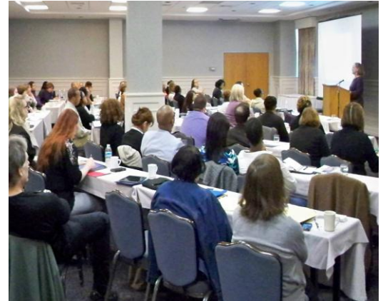
Members attentively listening!