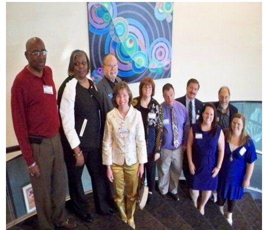
The VAAP Board of Directors at the 2014 Annual Members Meeting