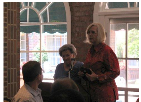
The VAADAC Counselor of the Year awards were presented at the 10 th Anniversary Virginia Summer Institute for Addiction Studies (VSIAS)