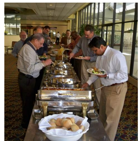
VAADAC members partaking of the delectables at an Annual Meeting.